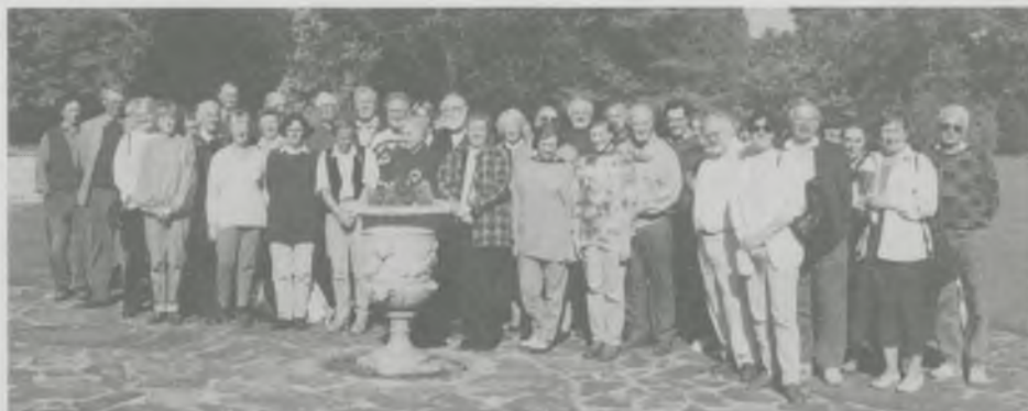
Grantley Hall, the assembled cast 1995.

Waiting for the band to arrive on practice night? Tie a clapper or two to practise handling and the skill of shortening/lengthening the rope when dodging.