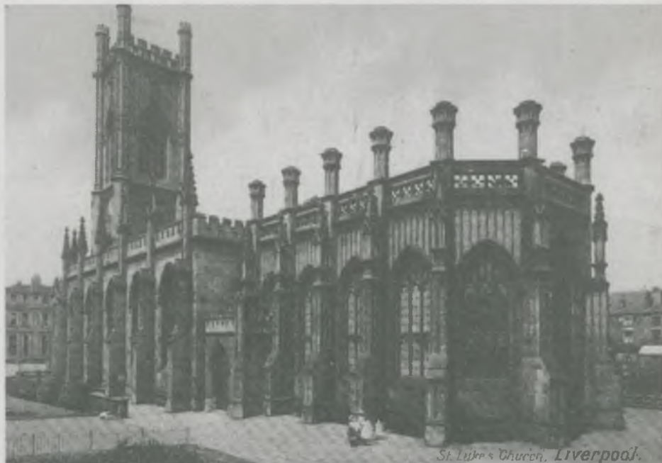
St. Luke's Church, Liverpool c.1900 when the eight bells were still in situ.