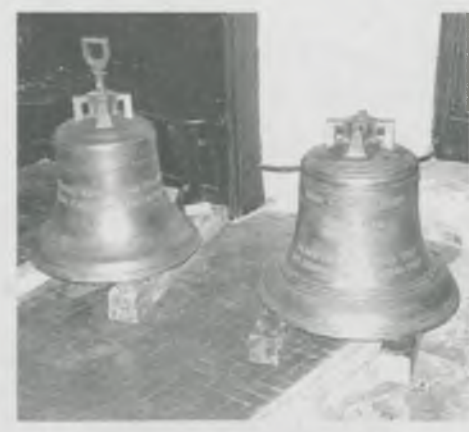
Pebworth's new peace bells.

The existing six bells were tuned at Whitechapel in 1987, and so it made sense to go to them for the retuning of our new treble and the casting of our new second. However, when they examined the Bishopstoke bell they advised us that it would not tune in well with the rest of the Pebworth ring. Panic! followed closely by immense relief and gratitude when the same anonymous benefactor offered to pay for a brand-new treble as well. The two donors of the Bishopstoke bell kindly agreed that it should be sold on and the money raised be put in the