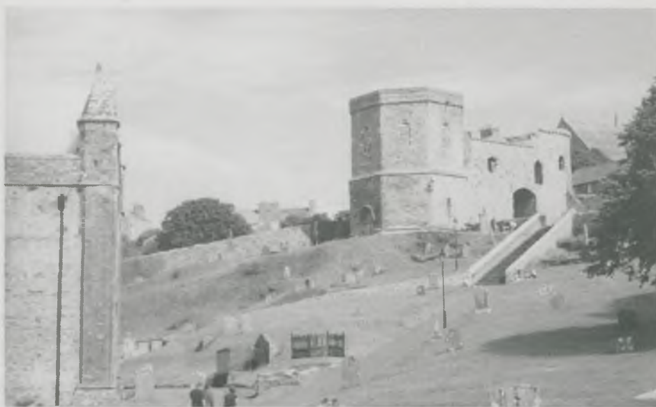
The gatehouse at St. David's Cathedral, Pembrokeshire which houses the bells.

On the Sunday morning several of us went for service ringing at Oswestry - our only English tower. Later that day one of our cars was stuck in a ditch on a minor road after ringing at Llanfihangel Rhydithion. A tractor and chains from a nearby farm did the trick. Unfortunately those involved in the mishap and rescue missed Old Radnor. We finished the day with good rings at Presteigne and Knighton and