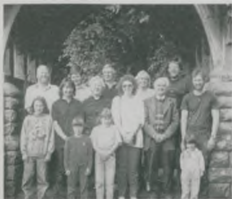
Pictured on their first visit as a band to ring the newly installed bells of Brecon Cathedral. These ringers are from St Mary's, Bronllys near Brecon.