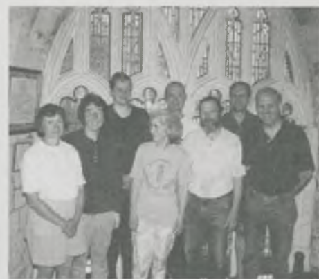
The Quarter Peal Band at Putney