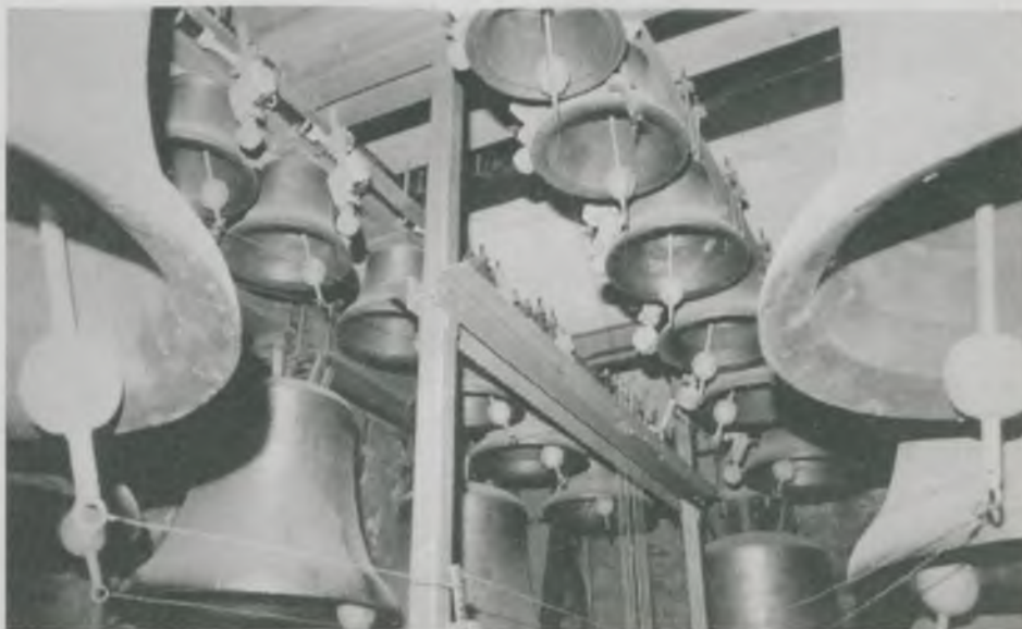
Some of the middle bells of the carillon