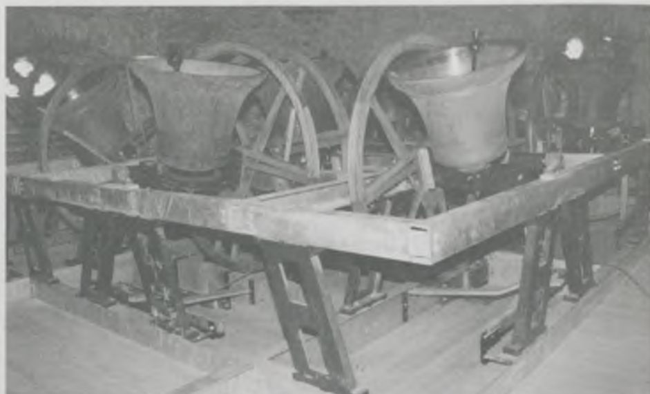
The ring of 10 at Brecon

The Swansea and Brecon Guild of Ringers and their cathedral have at last a peal of ten bells to be proud of. Through the columns of The Ringing World the Diocesan Guild and Cathedral Ringers wish to thank all individuals