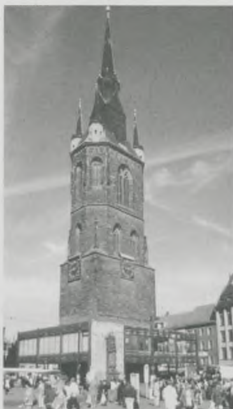
The Roter Turm in Halle an der Saale

The range of the carillon is f° - g° chromatic to a 6 , which bell is 163 mm. in diameter, with a weight of 10.7 Kg. Only one carillon, that at Bloomfield Hills in the U.S.A. with 77, has more bells than that at Halle; and there are only eleven such instruments in the whole world with a heavier bass bell. The Halle carillon is fitted with a baton type keyboard for playing with the fists and feet; but with more than six octaves, the keyboard is so wide that some pieces of music are better played four handed. Four octaves, from c 1 to c 5 , as well as the f° bass bell with a diameter of 2360 mm., can also be played electromagnetically from a piano type keyboard. This is also coupled to a computer, so that music can be recorded on a chip and replayed automatically. At the present state of the art,