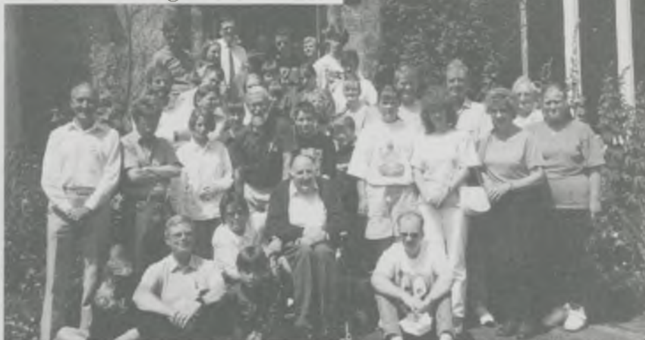
Students, helpers and tutors at Whirlow Grange

The Whirlow Course continues to be popular. This is obvious by the number of people who come every year to help. However is also good for ringing that there is always a big group of youngsters coming for the first time and that many youngsters are also making a return visit, and to see them making such rapid progress.