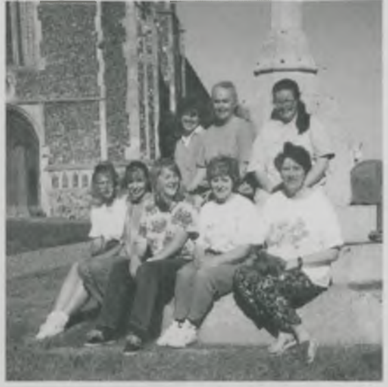
The Suffolk Guild all-Ladies peal band at Hollesley

The first peal of Surprise Major to be rung in the County by a band of resident ladies, and for the Guild. A compliment to