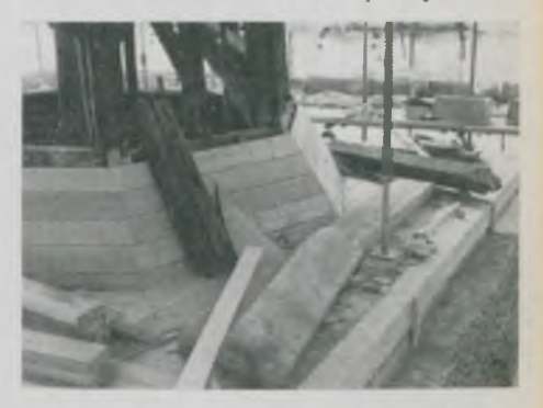
Massive re-construction required

The work caused endless problems throughout and as it progressed additional defects came to light one after the other, each one having to be re-evaluated and resolved before work could go on. So much of the tower was taken down and re-built completely that the