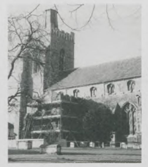
The South Porch under repair in 1989

century. The roof was leaking like a sieve, the remaining 'Stump' of the spire was extremely unstable and by 1991 occasional small masonry falls indicated that the problems were accelerating rapidly. However, the true picture was not apparent at that time and it was not until work actually started on the tower that the devastating truth became apparent.