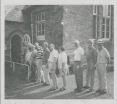
Lead us to the refreshments

More subtle are the efforts of those who devote hours of their time, and that of others, learning to ring well in order that they might be invited in peals which they can then sabotage by bringing up rounds prematurely or by dropping