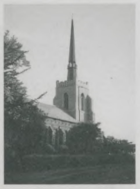
St Peter and St Mary's, Stowmarket

The spire, though, was only one of many problems associated with the tower. Massive cracks extended downwards from the bell frame through the clock chamber and down into the ringing chamber, where they had already begun to disrupt the masonry over the large window openings. These cracks had been present for many years and the tower structure had been steadily getting worse for probably at least a